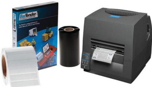
CITIZEN CL-S631 PRINTING KIT