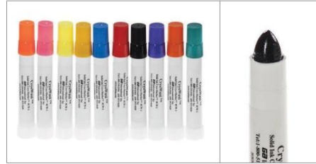
Big-Tip Cryo-Waxi™ Marker CW-1BL Blue