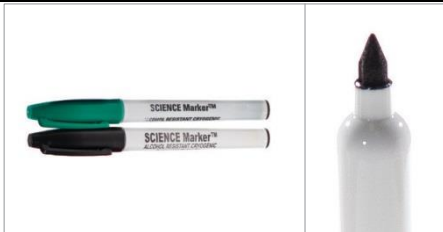
Alcohol-Resistant Science Marker SM-1B-6 Black