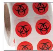
#WL-012-1P (comes in a dispenser box)