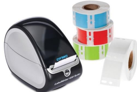
DYMO THERMAL PRINTING KIT