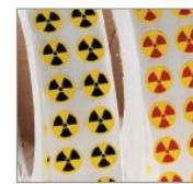
#WL-013-1P & WL-014-1P (comes in a dispenser box)