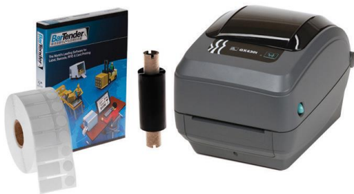
ZEBRA GX430t PRINTING KIT