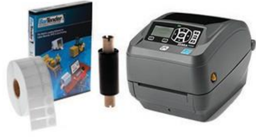
ZEBRA ZD500 PRINTING KIT