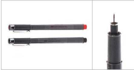
Micro-Tip Cryo-Marker™ F-1B Black