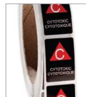
#L-001-1R & #L-001-1P