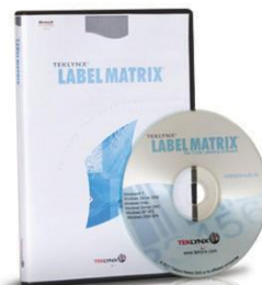
Label Matrix Barcode Label Design Software