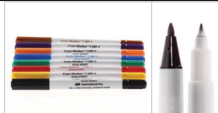
Dual Point Cryo-Marker™ MP-1B Black