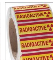
#L-004-1R & #L-004-1P