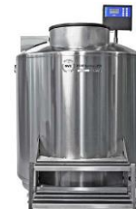
Liquid Nitrogen Storage