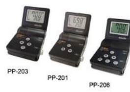
Multi-Function Foldable Portable Meter**