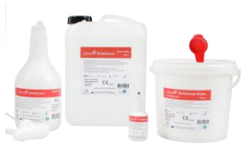
Medical Device Disinfectant