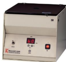
Micro Haematocrit Centrifuge