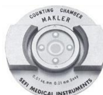
Sperm Counting Chamber