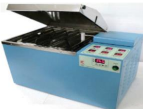
Plasma Thawing System