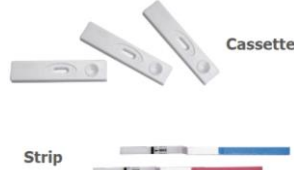
Drug (DOA) Test