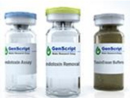
Endotoxin Assay Kit