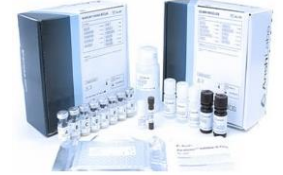
AMH Detection Kit