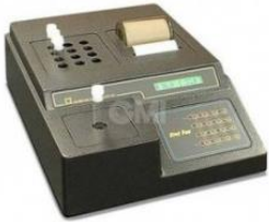
Clin. Chemistry Analyzer