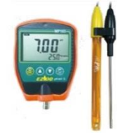
Multi-Function Handheld Meter**