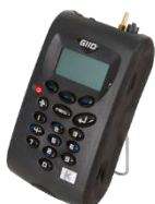
CO 2 and O 2 Gas Analyzer