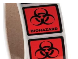
Warning & Safety Labels