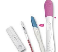
One-Step HCG Urine/Serum Test

***Please contact us for your requirements.