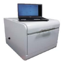
Soon: Auto. X-matching