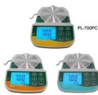
Multi-Function Bench Top Meter**