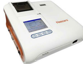
POCT / Rapid FIA