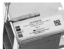
Metal Racks Label