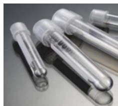
Testtube with cap