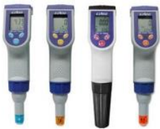
Multi-Function Pen Type**