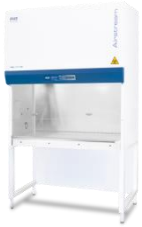
Biosafety Cabinet (BSC)