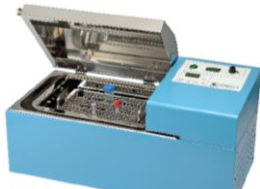
Shaker Water Bath