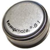
Mini Data Loggers