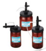
Volume Bottle Dispenser