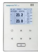
SMS Alarm Module for Temperature