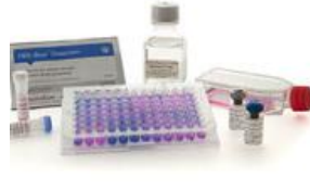
Mycoplasma Detection Kit