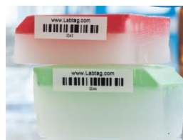
Paraffin Wax Labels