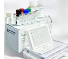
ELISA Detection Kits