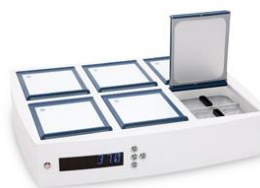
Bench Top Incubator