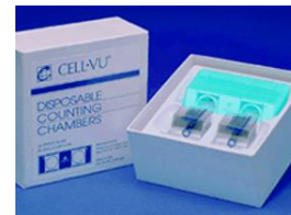
Disposable Sperm Counting Chambers