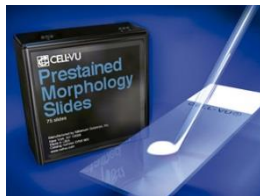
Pre-Stained Morphology Slides