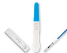
FSH Urine Test