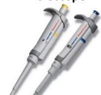
Pipettors and Tips