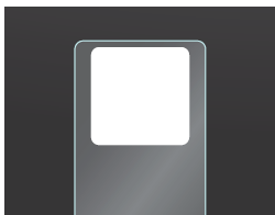
Chemical-Resistant Slide Labels