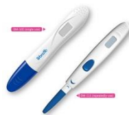
HCG Urine/Serum Test