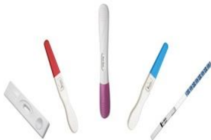
LH Ovulation Test