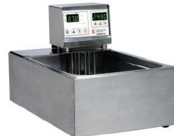
Water Bath / Dry Bath