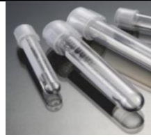
Testtube with cap