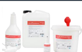
Medical Device Disinfectant