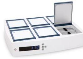
Bench Top Incubator