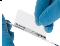
IVF Straw Labels