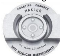
Sperm Counting Chamber